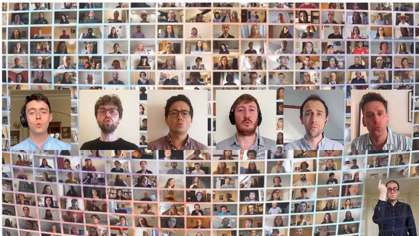
*Special Performance of The King's Singers at the Closing Ceremony BCS-2 nd World Virtual Choir Festival 2020